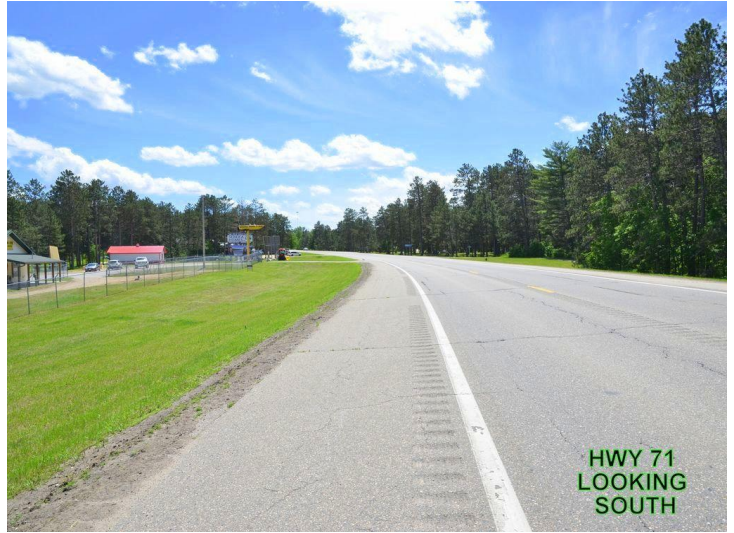
HWY 71 LOOKING SOUTH