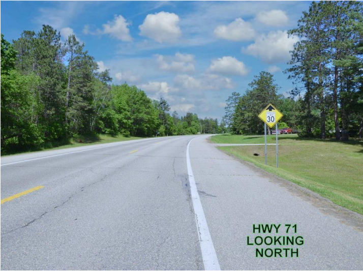
HWY 71 LOOKING NORTH